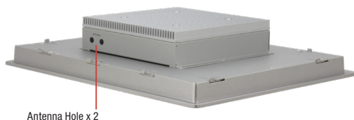
Antenna Hole x 2